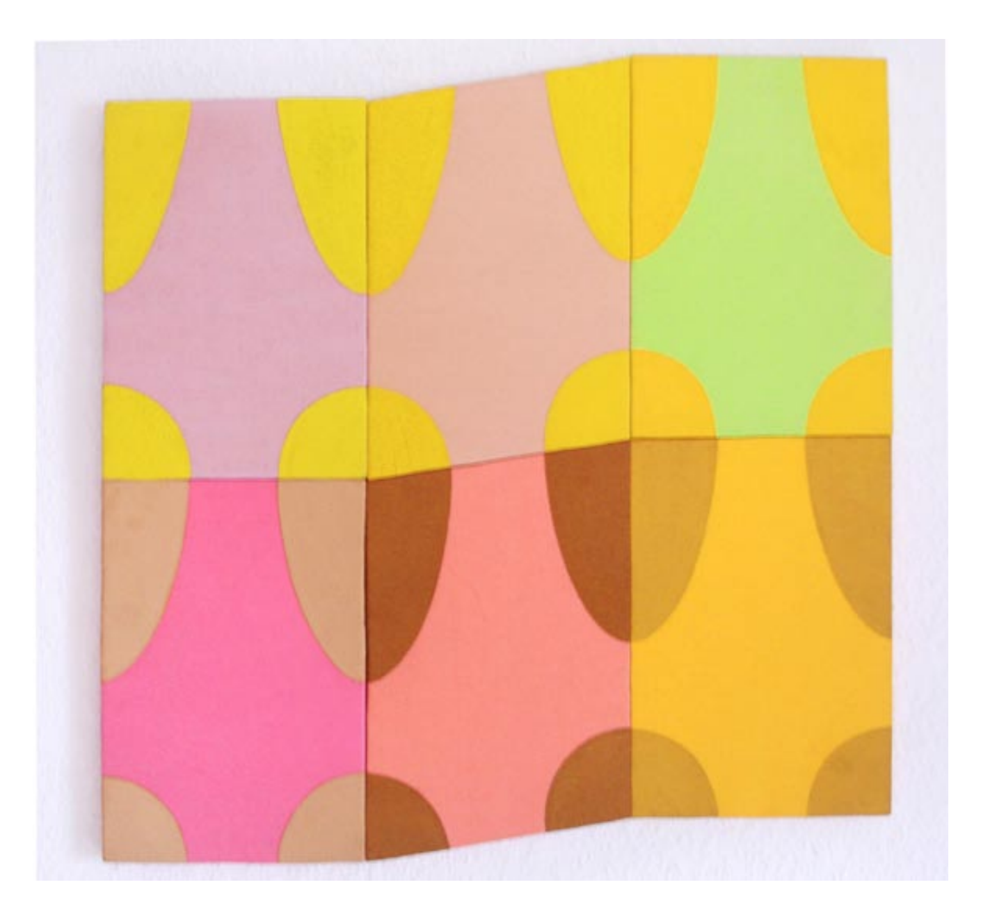
Pair of heads 15. acrylic on canvas. 1993