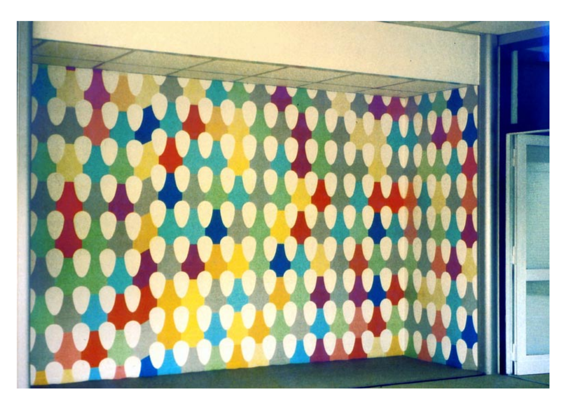
Heads. colored copypaper on wall. Heinrich Kraft school Frankfurt am Main. 1992