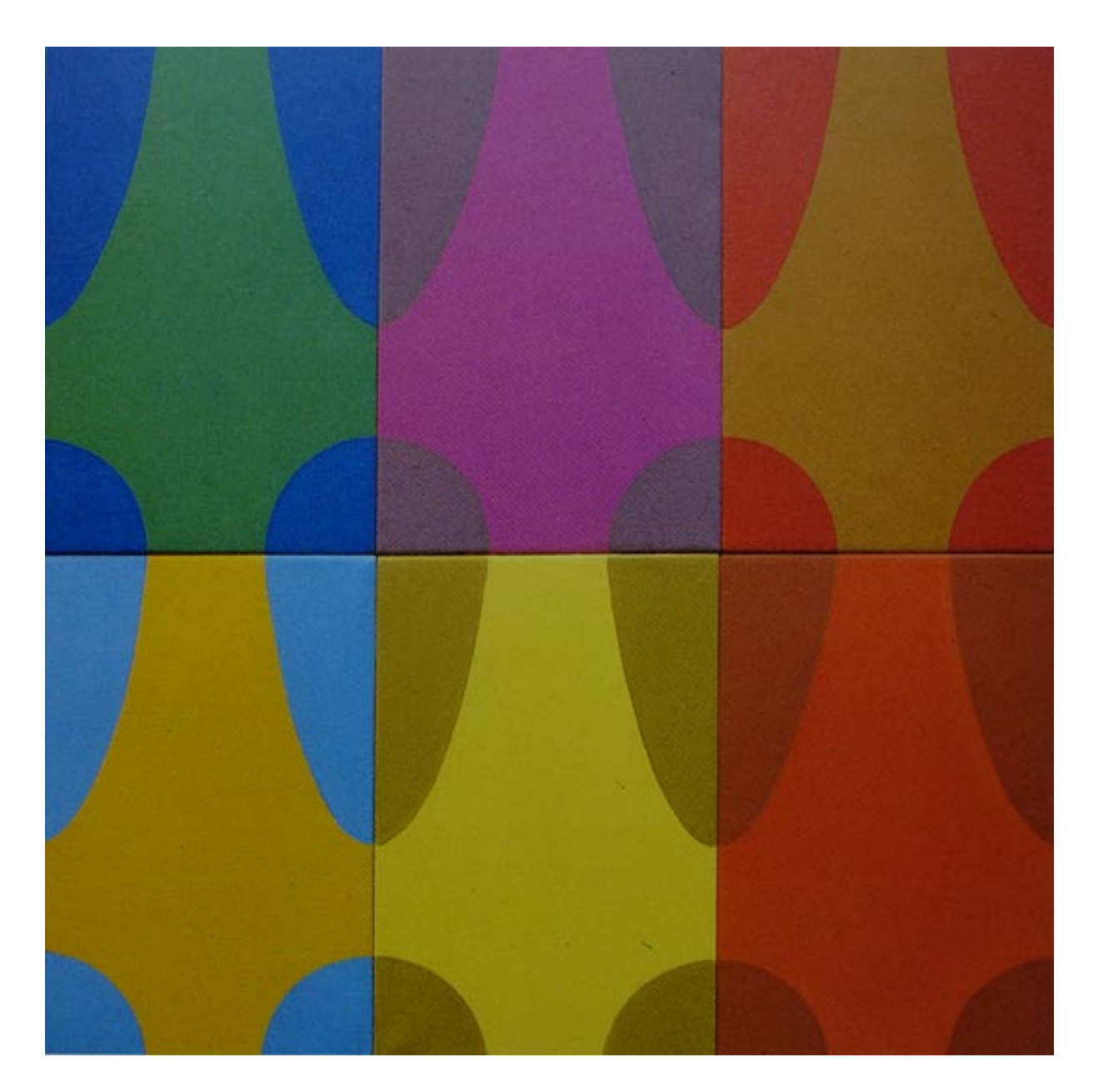
Pair of heads 2. acrylic on canvas. 1989